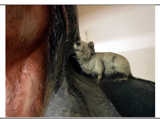
While the pirates have a parrot, this adventurer has a little mouse. What is the name of this character?

Did you find everything? Yes? Congratulations and we hope you had fun.