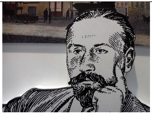
This person is very important for the Comic Strip Museum. Can you find his name?