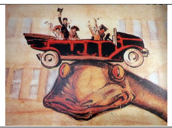
Do you know the name of this funny dinosaur?