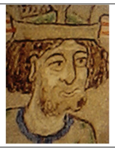
Which biblical character is shown here?