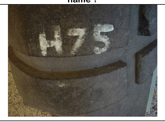
What is the name of the no longer existing building to which this stone belonged?