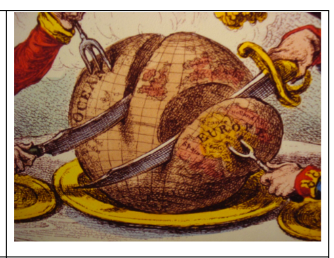
What is the nationality of the character to the right on this drawing?