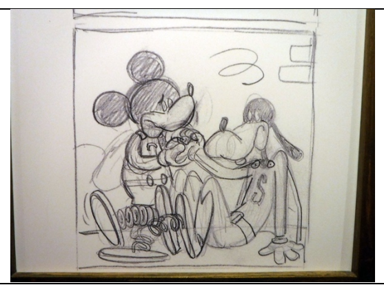
What happened to Goofy to be consoled by Mickey?