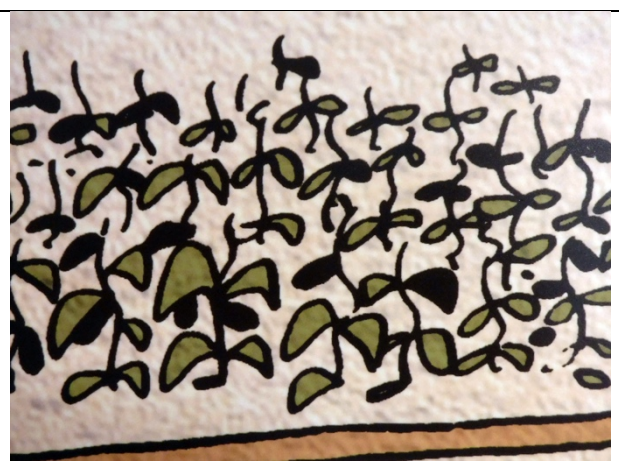
Can you find this field and give the name of this plant?