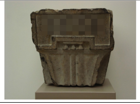
What is the year that has been erased on this image of a stone belonging to the construction that used to occupy the site before the Comics Art Museum?