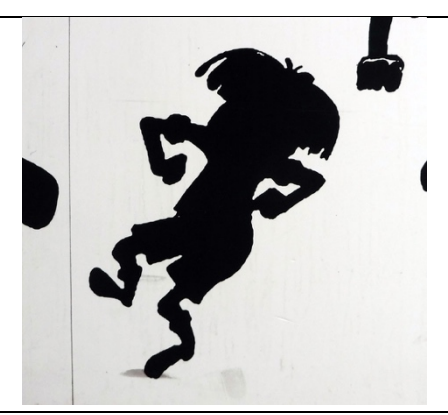
What other characters does Jommeke dance with ?