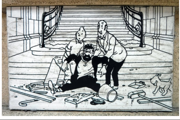
Where precisely in the museum can you find this drawing?